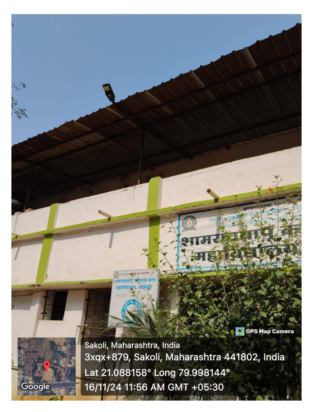
Solar Light for Energy Conservation